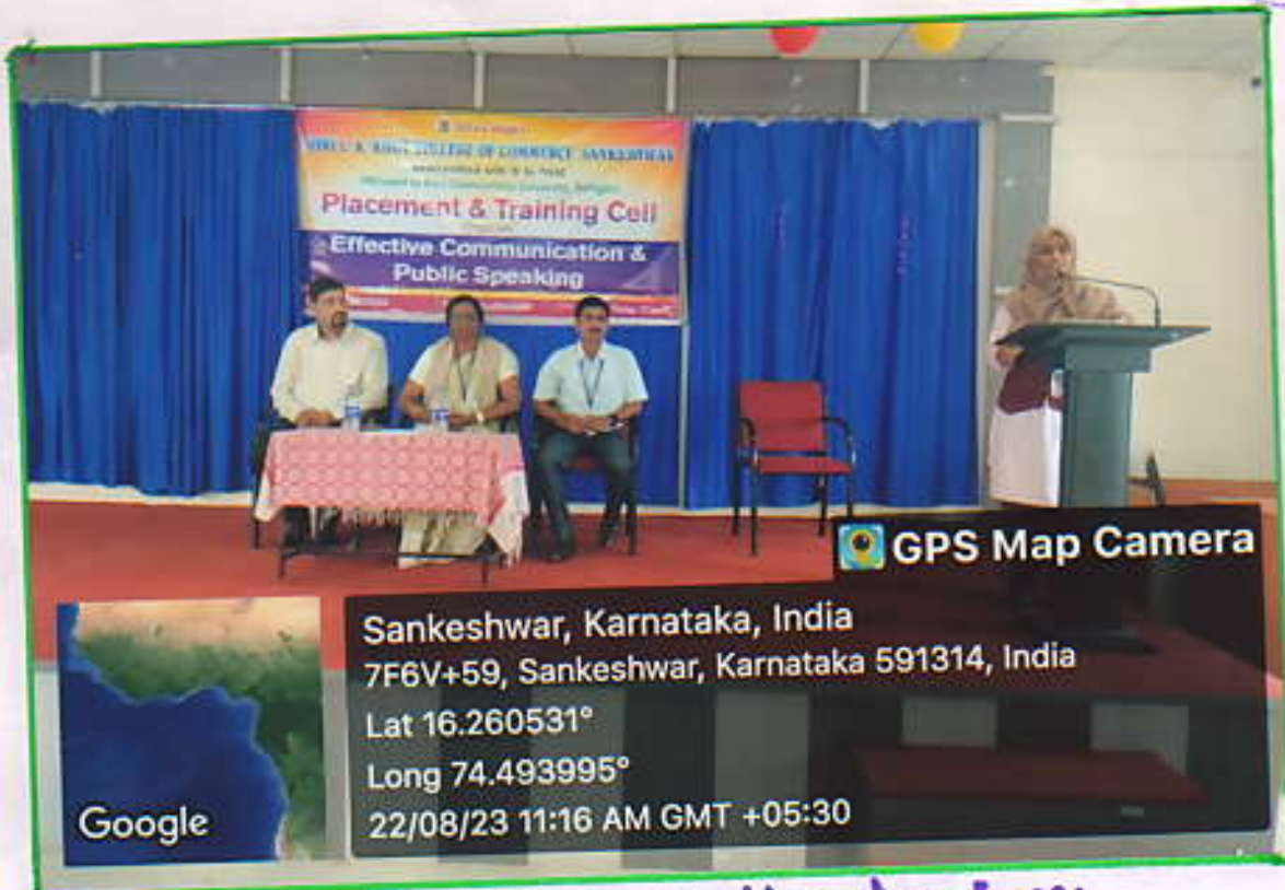
Feedback by one of the trainees