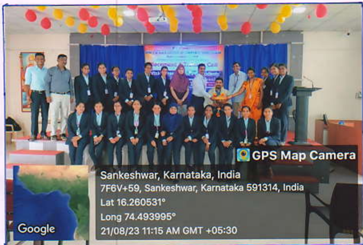
Group photo with the trainer along with the president, co-ordinator & Students.