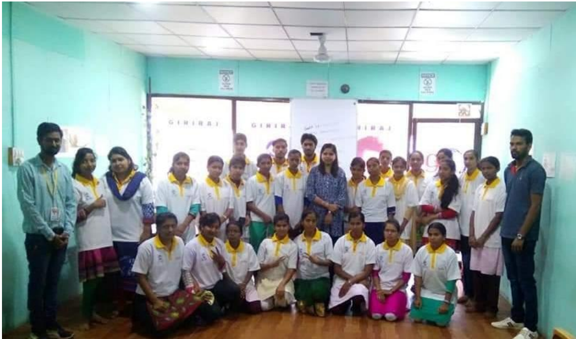
Group Photo of students and facilitators at Giriraj Foundation during Goods & Services Tax (GST) Accounts Assistant Certification Course 2017-18