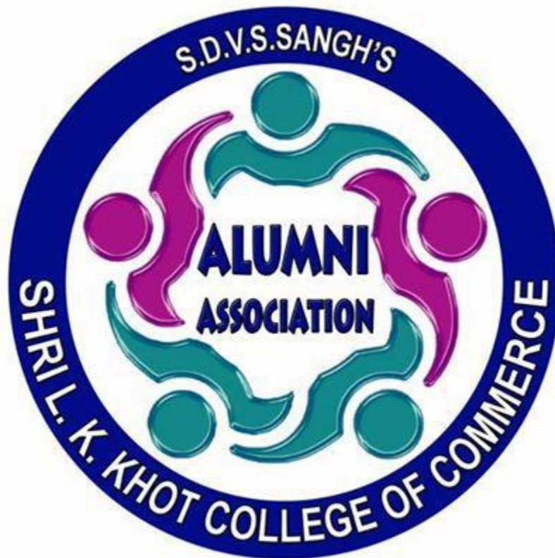
ALUMNI ASSOCIATION LOGO