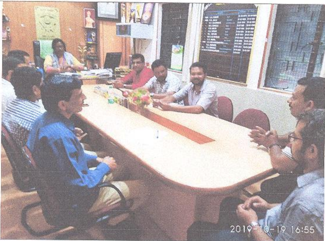
Alumni Association Meeting